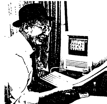
Club Newsletter: a bi-monthly digest of news and views

Outdoor sketching trips: groups of seven (and more) with palette and pencil