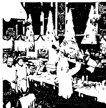
The Boar's Head Dinner: a Christmas celebration of splendid colour and pageantry

The Great Hall: festive dining-room theatre, concert hall